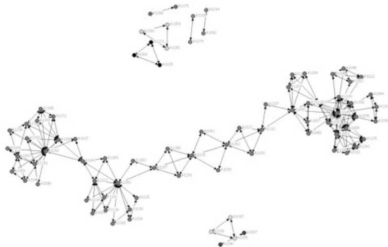
(b) Fujisawa collaboration network, 1984